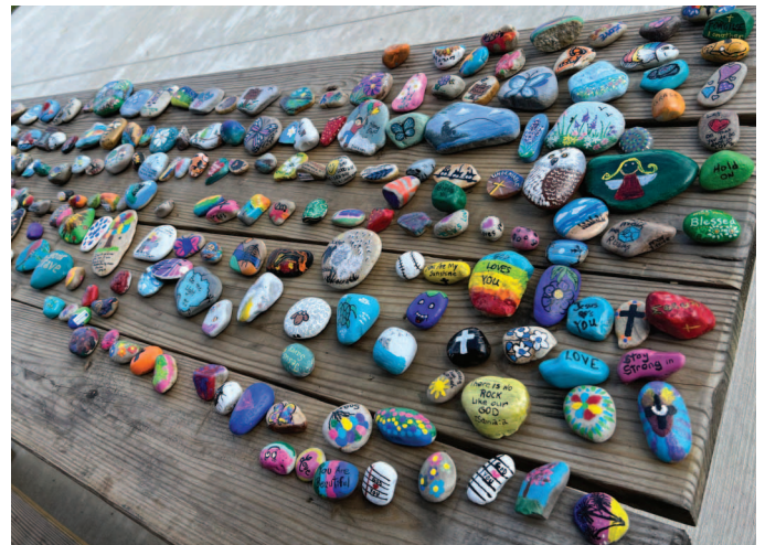
Crossroads Rocks! Creative Painted Rocks Donated By Crossroads Church.