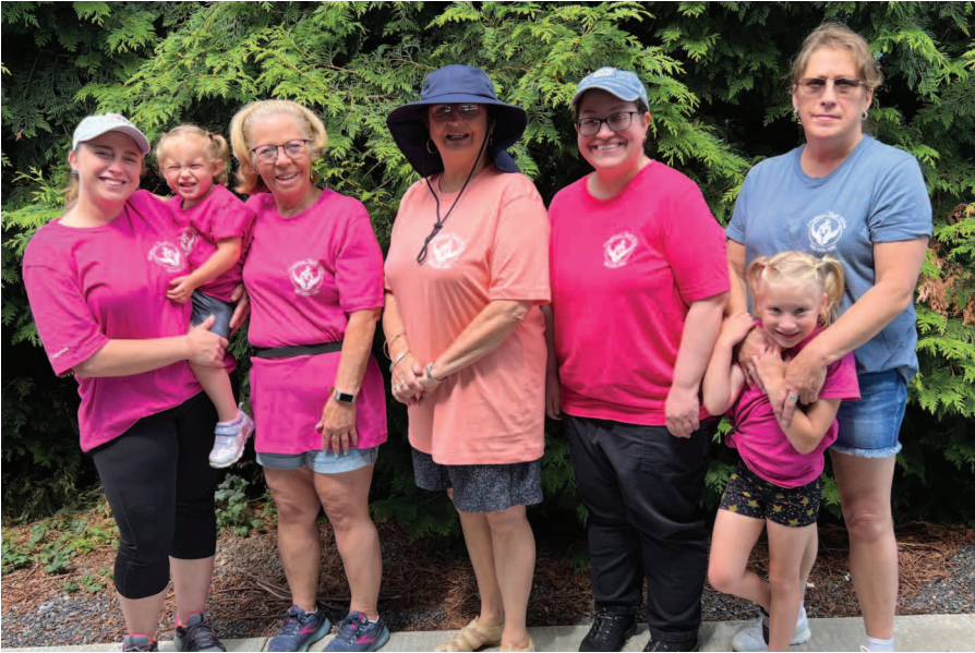
Thank you Highland Thrift Shop Ladies For Supporting Our Walk!!