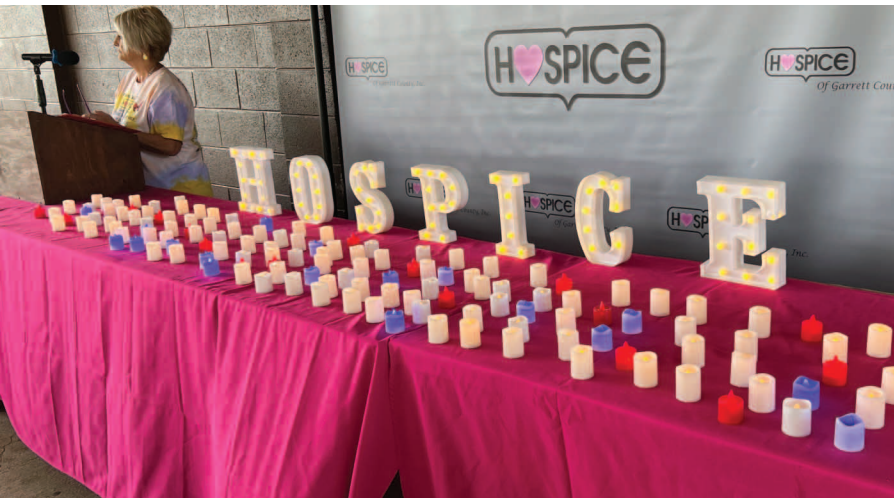
Candles Representing Our Loved Ones From May 2023 to April 2024