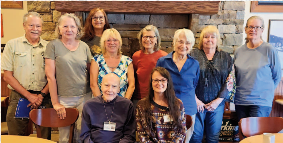
Volunteer Training 2024