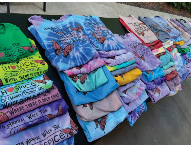
Walk Shirts Proudly Displaying Sponsors