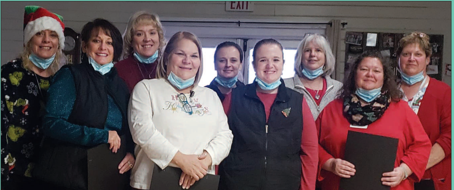
Hospice Staff Carols For Patients & Families